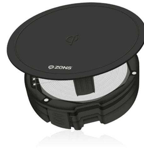
ZENS PUK 2 BEACON WIRELESS FURNITURE CHARGER ZETC03N/00 ZETC04N/00